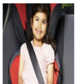
4+ years Approved forward- facing child car seat or booster seat