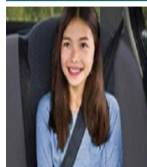
145cm or taller Suggested minimum height to use adult lap-sash seatbelt