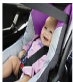
Up to 6 months Approved rear-facing child car seat