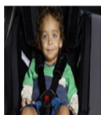
6 months to 4 years Approved rear- or forward-facing child car seat