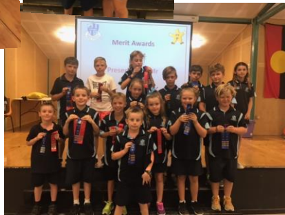
Swimming Carnival Ribbons